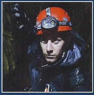
SCRUFFS XTREME WORKWEAR TEST