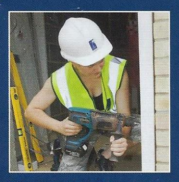
GETTING TO KNOW THE DRILL WITH MAKITA