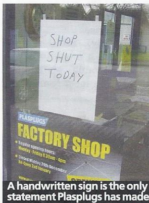
A handwritten sign is the only statement Plasplugs has made

A source, who declined to be named, told DIY Week that administrators had been called in as early as two weeks ago. Although the company is not officially in administration, our source told DIY Week that Plasplugs directors were currently putting together a pre-pack