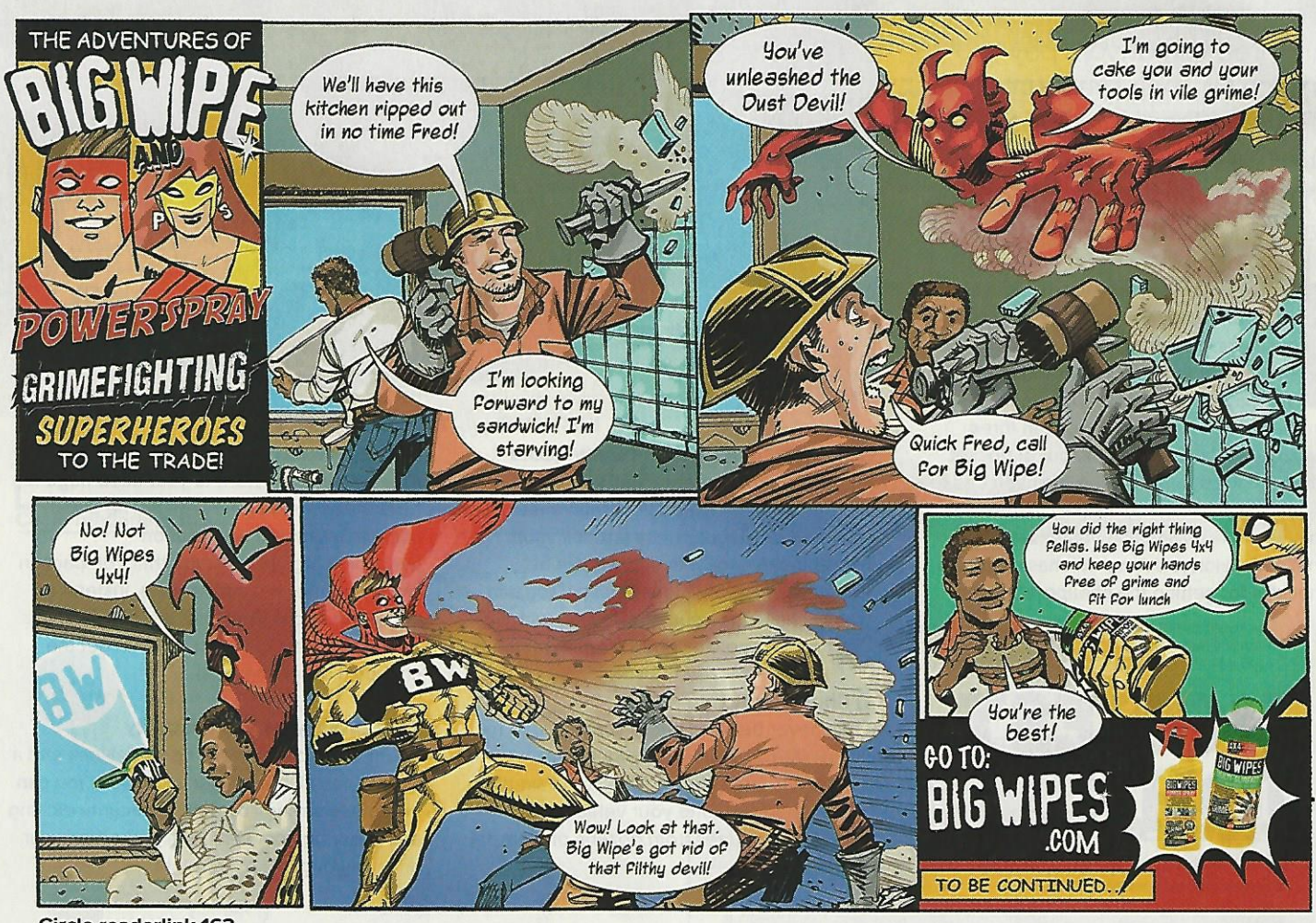
Circle readerlink 163