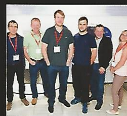
A penny for them - p30 Heating engineers share their thoughts on the latest industry issues

See why Mira electric showers last up to 50% longer