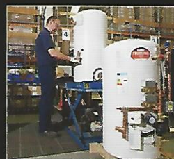
Record investment - p24 Kingspan Environmental is leading the way with investment and innovation